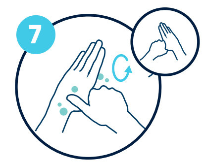
Rotational rubbing of left thumb clasped in right palm and vice versa;