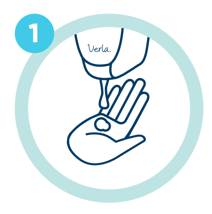
Apply Verla Blue Hand Sanitiser to all surfaces of a cupped hand.