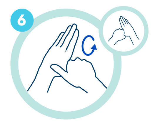
Rotational rubbing of left thumb clasped in right palm and vice versa;