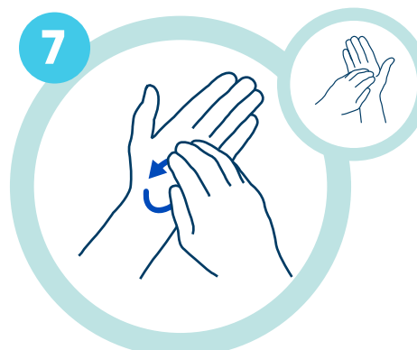
Rotational rubbing, backwards and forwards with clasped fingers of right hand in left palm and vice versa;